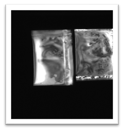
Figure 2. Greyscale hyperspectral image of anthocyanin reflection index in the biodegradable film.

The initial hypothesis suggested that the agricultural by-products used in the film formation would exhibit a significant presence of phenolic compounds, contributing to the film's functional properties. The results confirmed that the biodegradable films contained a concentration of 17,26±2,50mg GAEcm<sup>-2</sup> total phenolic compounds, which were unevenly distributed across the samples, as represented in Figure 2.