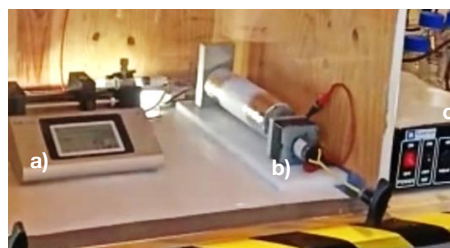
Figure 1. Photograph of the electrospinning system. a) injection pump, b) collector and c) high voltage generator.

using an eco-compatible sol-gel method previously reported [2] that generates carbon autodoped and iron doped mesoporous solids without the need of surfactants. The photocatalytic fibers were synthesized using an electrospinning equipment belonging to INMA, Zaragoza, Spain. This equipment, shown in Figure (1), consists of an injector pump, a source of high electrical voltage generation and a collecting surface where the fibers are deposited. For the preparation of the synthesis gel, mesoporous TiO 2 nanoparticles were combined with N,N-Dimethylformamide. This suspension was heated to 60°C to then incorporate the PAN (polyacrylonitrile). The fibers thus obtained were called FB:MT (mesoporous TiO 2 ), FB:FeMT (TiO 2 with the addition of Fe), and FB:FeMT-150 (TiO 2 , Fe and a post treatment at 150 °C).